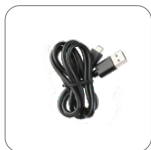
Data cable PC143