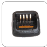
MUC Rapid-rate Charger