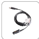
Programming cable PC155